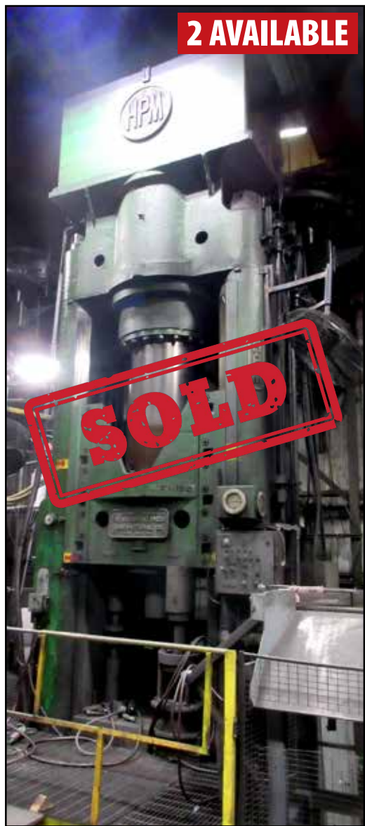
HPM 1000 TON HYDRAULIC HOT FORGING PRESS