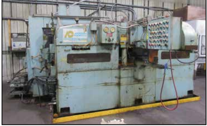
ANDERSON COOK MARAND NO 350 48" SPLINE ROLLER

ANDERSON COOK MARAND NO 350 48" SPLINE ROLLER, s/n 302 MARAND 48" SPLINE ROLLER, s/n NA (2) BARBER COLMAN 6-5 GEAR HOBBERS, s/n 197, NA BARBER COLMAN 16-11 GEAR HOBBER, s/n 175 BARBER COLMAN 14-15 GEAR HOBBER FELLOWS NO. 12 GEAR SHAPER, s/n 30039 *Sold Prior to Auction* 1991 REDIN DEBURRER, s/n 24E37 RED RING GEAR FINISHER BARBER COLMAN T HOBBER