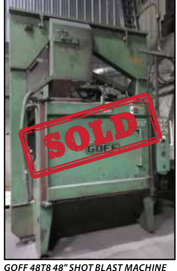
Auction will be conducted in Canadian (CAD) Funds.