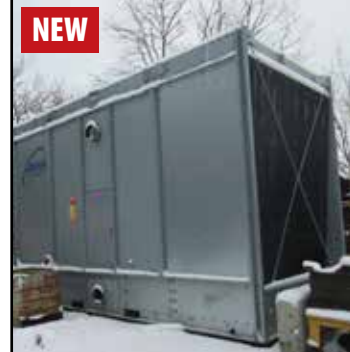
MARLEY 10020311-A1-C8403MF-10 NC COOLING TOWER - NEW, NEVER INSTALLED