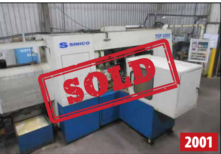
SINICO MOD TOP 2000 TYPE TR 60/4-350-1T-M AUTO CUTTING/BAR END FINISHING MACHINE