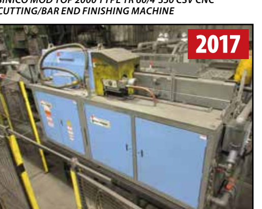
Auction will be conducted in Canadian (CAD) Funds.