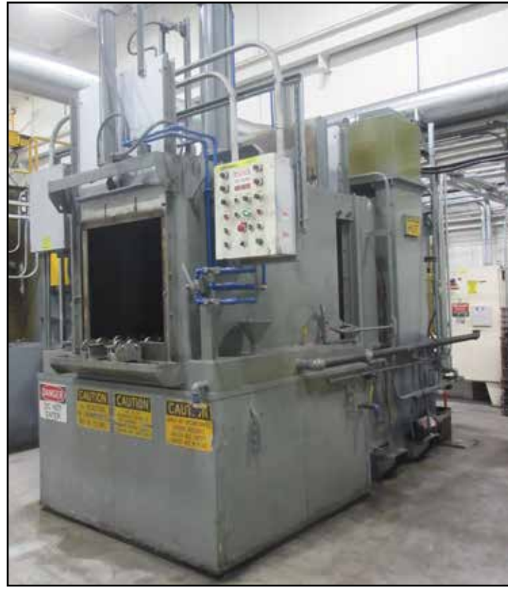
SURFACE COMBUSTION WILLIAMS PRE/POST CARBURIZING 2 STAGE WASH SYSTEM

MARLEY 100203II-A1-C8403MF-10 NC COOLING TOWER - New, Never Installed