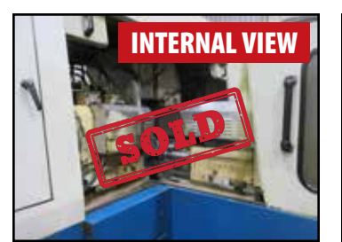
2001 SINICO TOP 2000

KINEFAC TWIN SPINDLE TURNING CENTER, s/n 1255, w/ GE Fanuc 18i-T Control