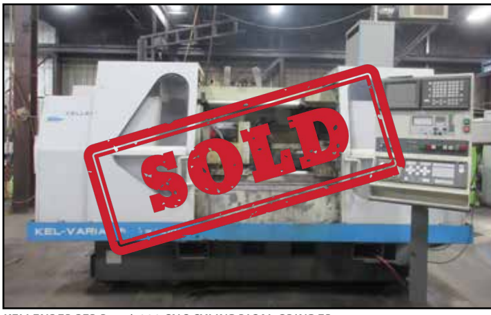
KELLENBERGER R175/1000 CNC CYLINDRICAL GRINDER

SCHNEIDER JORHB2 24" ROTARY SURFACE GRINDER, s/n 2136/65 FISCHER ZSM1000 CENTER POINT GRINDER, s/n 231 STUDER RHU-400 UNIVERSAL CYLINDRICAL GRINDER, s/n 632.39 ZOCCA RW500/3 UNIVERSAL CYLINDRICAL GRINDER, s/n NA JACKMILL 10X26 CYLINDRICAL GRINDER, s/n NA