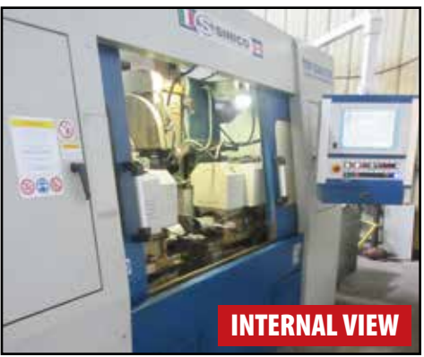
2015 SINICO TOP 2000