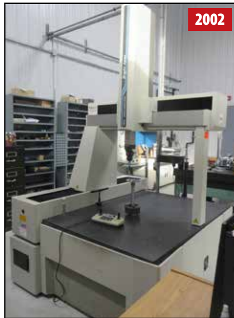
MITUTOYO BRT-A910 CMM

Rigging contact info available at: www.perfectionindustrial.com