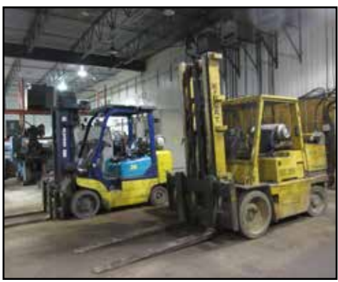
KOMATSU & CAT FORKLIFTS