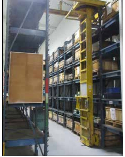
2,000 LB STORAGE/RETRIEVAL CRANE & RACKING SYSTEM

KOMATSU PG-35ST-77,340 LB LPG FORKLIFT, s/n 103056A HYSTER H60XM 5,500 LB LPG FORKLIFT, s/n H1778496518 TOYOTA 7FB25 3,600 LB LPG FORKLIFT, s/n 25612 *Sold Prior to Auction* HYSTER H250E 25,000 LB LPG FORKLIFT, s/n NA CAT 20,000 LB LPG FORKLIFT