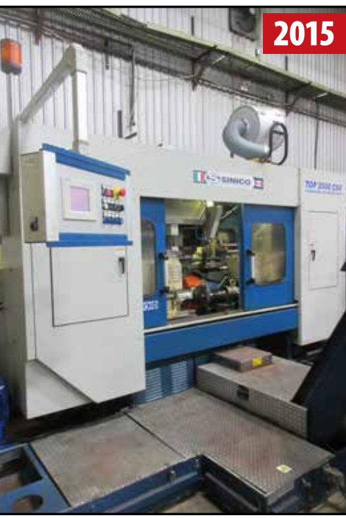
SINICO MOD TOP 2000 TYPE TR 60/4-350 CSV CNC CUTTING/BAR FND FINISHING MACHINF